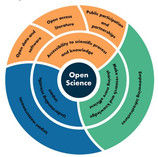
Figure 4: Open Science Concept

When sharing data, researchers should adhere to the FAIR principles (Findable, Accessible, Interoperable, and Reusable) outlined by Wilkinson et al. (2016). This involves depositing data in appropriate repositories, providing comprehensive metadata, and using standardized formats to ensure interoperability. Many journals now require data availability statements and encourage or mandate data sharing, reflecting the growing importance of these practices.