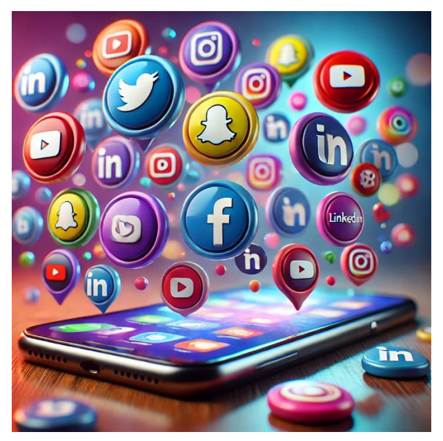
Figure 1: Social Media Platforms

When using Twitter, researchers should craft engaging tweets that summarize key points of their work, using relevant hashtags to increase visibility. Côté and Darling (2018) found that scientists with a broad Twitter following reached more non-scientists, suggesting that cultivating a diverse follower base can help bridge the gap between academia and the general public. Creating threads of tweets to explain complex findings, using visuals such as infographics or charts, and engaging in discussions about the research can all contribute to increased visibility and engagement.