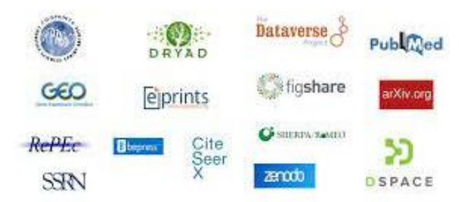
Figure 2: Open Access Repositories

Pre-print servers have emerged as another important avenue for open-access dissemination. Platforms like arXiv, bioRxiv, and others allow researchers to share their work before formal peer review and publication, potentially accelerating the dissemination of new findings. Pre-prints' impact on research visibility and citations has been the subject of several studies. For example, Fraser et al. (2020) reported that pre-prints in biology received attention on par with peer-reviewed articles of the same age, suggesting that early sharing can significantly boost the visibility of research.